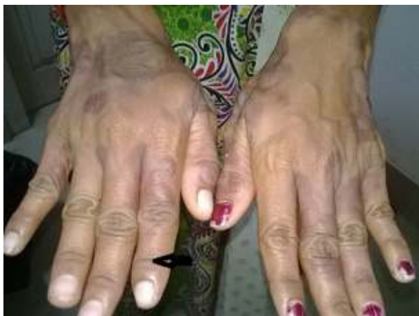
Fig. 1: Arrow showing the distorted angle of nail bed.

On admission at 32 weeks for threatened preterm labor she was managed conservatively & steroids were given for pulmonary maturity. Her hemoglobin was 11.3 gm% and haematocrit of 41%. An electrocardiogram showed a sinus bradycardia with sinus rhythm, ST changes in lead V1, V2, V3; left axis deviation with intraventricular conduction defects (Fig. 2). Repeat sonography revealed high resistance