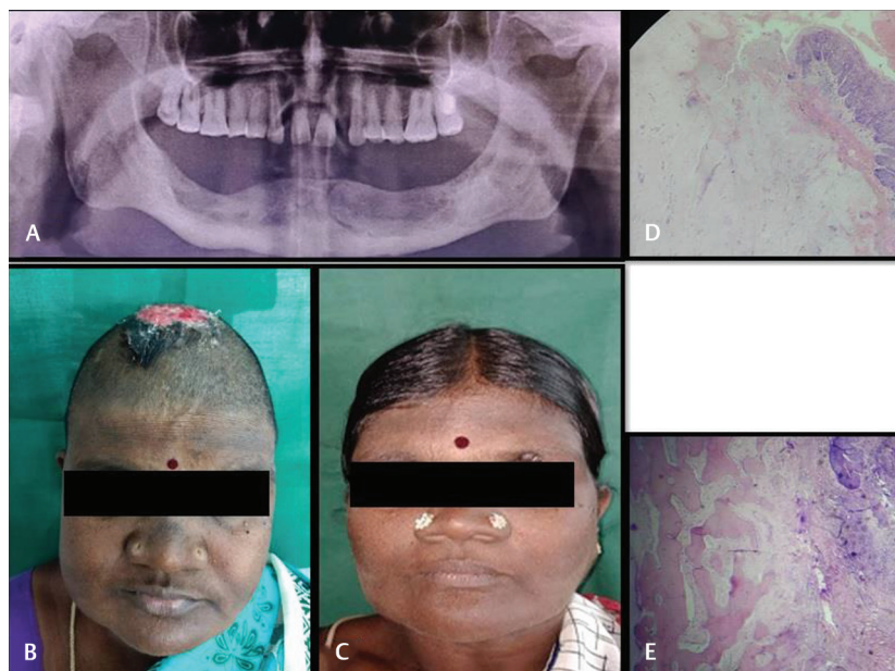
Fig. 3 (A) Postoperative OPG taken after 1-year follow-up. (B, C) Preoperative and postoperative clinical pictures. Photomicrograph of H&E stained histological section under \times 10 and \times 40 magnification shows (D) corrugated parakeratotic stratified squamous epithelium with basal cuboidal to columnar palisading epithelium cells, (E) underlying fibrocollagenous stroma with collection of inflammatory cell infiltrate. H&E, hematoxylin and eosin; OPG, orthopantomogram.

which gave upsurge to the Gorlin–Goltz syndrome. 4 Clinical indicators of the syndrome are grouped into the following five categories. Cutaneous anomalies include basal cell nevus, other benign dermal cysts and tumors, palmar pitting, palmar and plantar keratosis, and dermal calcinosis. Dental and osseous deformities include multiple OKCs, mild mandibular prognathism, frontal and temporoparietal bossing, kyphoscoliosis or other vertebral defects, and bifurcated ribs. Ophthalmic differences include hypertelorism, wide nasal bridge, dystopia canthorum, congenital blindness, and internal strabismus. Neurological variances include mental retardation, dural calcification, bridging of sella, agenesis of corpus callosum, congenital hydrocephalus, and medulloblastoma. Sexual malfunctions include hypogonadism and ovarian tumor-like fibrosarcoma. 5 Evans et al first ascertained the major and minor criteria for the diagnosis of the syndrome which were later revised by Kimonis et al in 2004. More than 100 minor criteria have been described. The presence of two major and one minor or one major and three minor criteria is essential to establish a diagnosis. 6 The major criteria include the following: