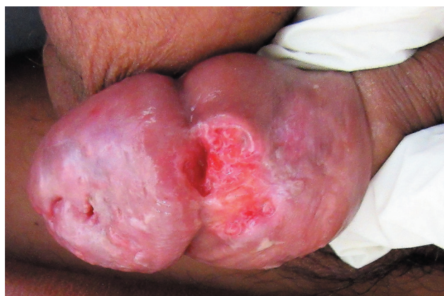
Fig. 1 Multiple ulcers on the coronal sulcus and neck of glans with irregular margins and granulation tissue at the floor.

papulonecrotic tuberculid of penis was made on the basis of history, clinical examination, histopathological examination, and laboratory investigations. Antitubercular therapy was started for 6 months (isoniazid, rifampicin, pyrazinamide,