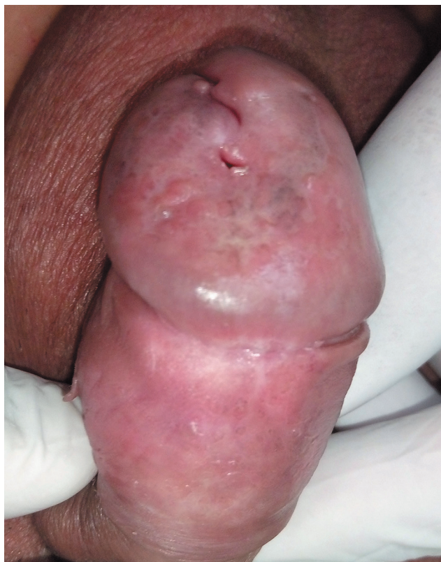
Fig. 3 Healed ulcers with depressed scars after 6 months of antitubercular treatment.

and ethambutol for 2 months followed by isoniazid, rifampicin, and ethambutol for 4 months) and complete healing with depressed scars occurred after 4 months of therapy (► Fig. 3 ).