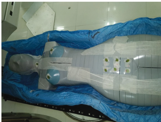
Fig. 3 Photograph with female Atom phantom with pelvic thermoluminescent dosimeters in situ.

aggressive malignancies. For situations where RT contributes significantly to disease control and QOL, RT may be planned in later pregnancy with necessary precautions, such as pretreatment phantom-based dose simulations, abdominal lead shielding to reduce fetal exposure, treatment plan modifications (linear accelerator with beam energy <10 MV preferred over cobalt-60, 3DCRT with minimal beam modifying devices preferred over intensity modulated RT, flattening filter-free beams). 11 During cranial RT in the second trimester, the fetal position is at a distance of 40 to 50 cm from the cranial field edge. At this distance, the contribution from external scatter exceeds that from internal scatter. 12 The major contributors to fetal dose include leakage from machine head (nearly 50%), wedge scatter, collimator scatter, and internal scatter; hence, shielding near machine head/patient neck may help curtail fetal exposure. 13